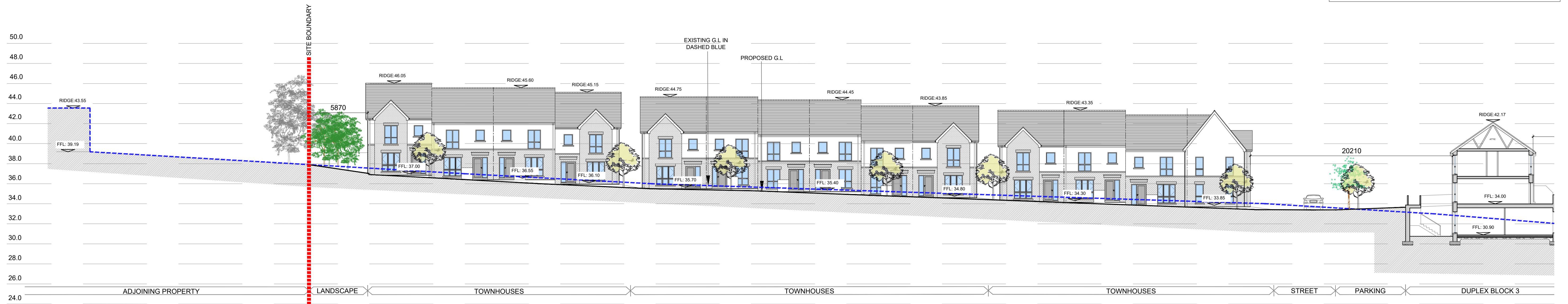
PROPOSED SITE SECTION B-B (PART A) 1:200 @ A1

DO NOT SCALE. WORK TO FIGURED DIMENSIONS ONLY. ALL EXISTING DIMENSIONS TO BE CHECKED ON SITE. DRAWN ON AUTOCAD R2004 AT DEADY GAHAN ARCHITECTS LTD LAYERS ON THIS DRAWING COMPLY WITH BS 1192: PART 5