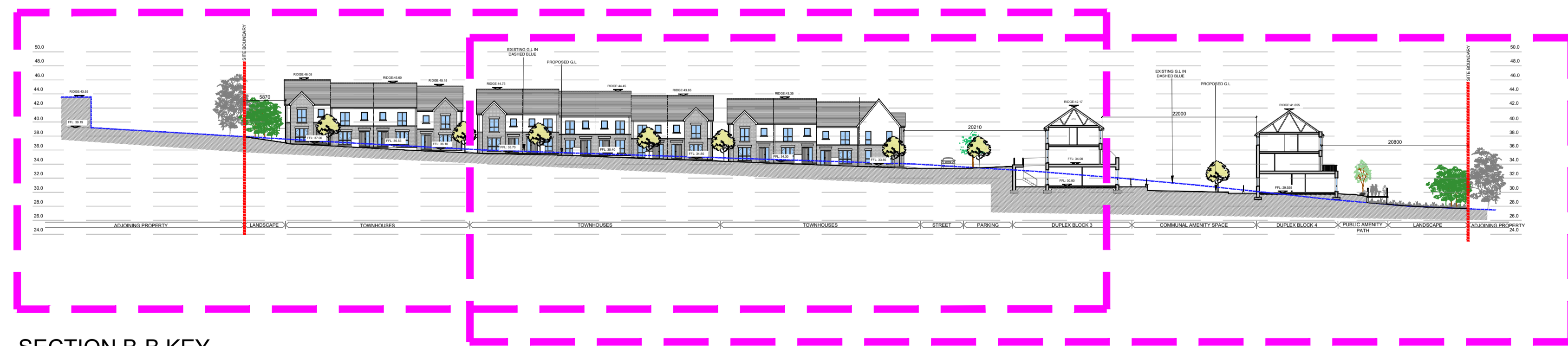
SECTION B-B KEY 1:500@A1